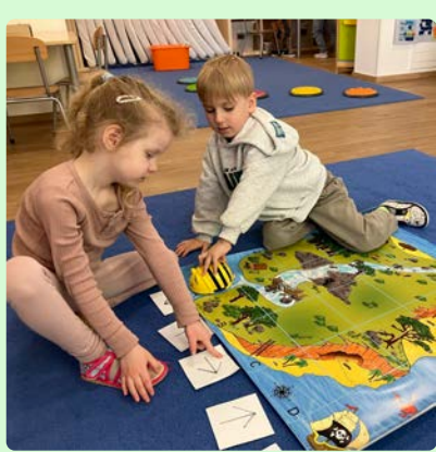
Are you interested what was special in our classes? Click here to check the activities we've been working on.